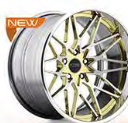
PHOENIX | F251 CONCAVE forged