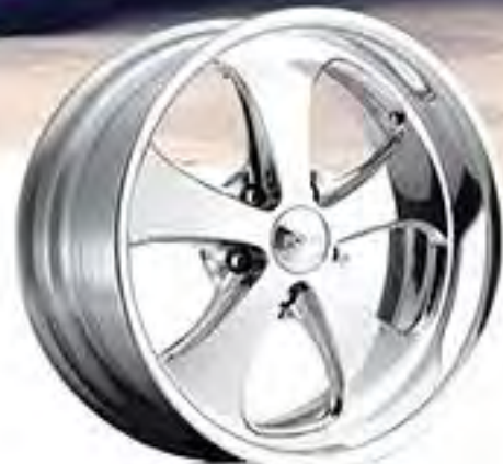
INJECTOR | F211 forged