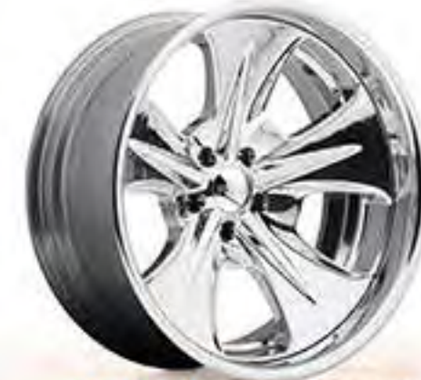
HERITAGE | F262 CONCAVE forged