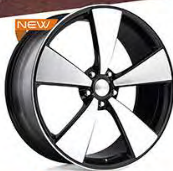
CASABLANCA | F511