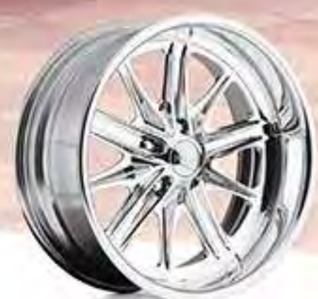
P33 | F222 forged