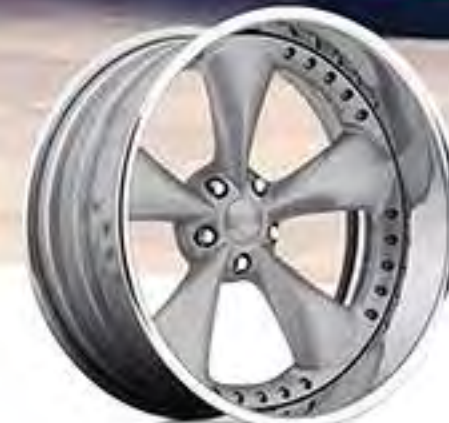
NITROUS - CONCAVE | F252 forged patent D455696