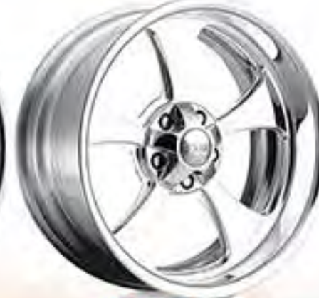
GENUINE | F210 forged