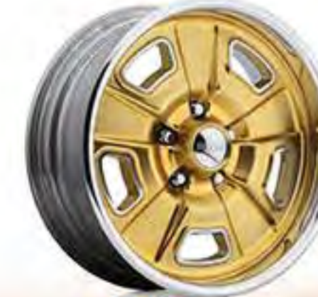
FOUR42 | F230 forged