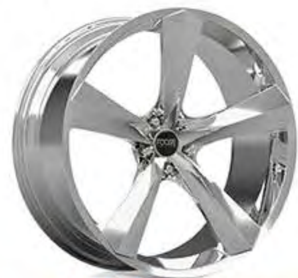
QUALIFIER | F520 RENDERING SHOWN