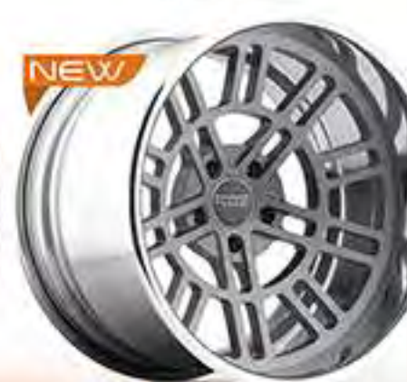
SHELBY | F218 CONCAVE forged