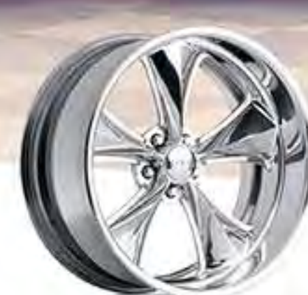
NITROUS | F201 forged / cast 15, 17, 18 & 20 patent D455696