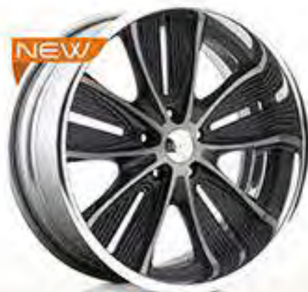
ARCH | F240 forged