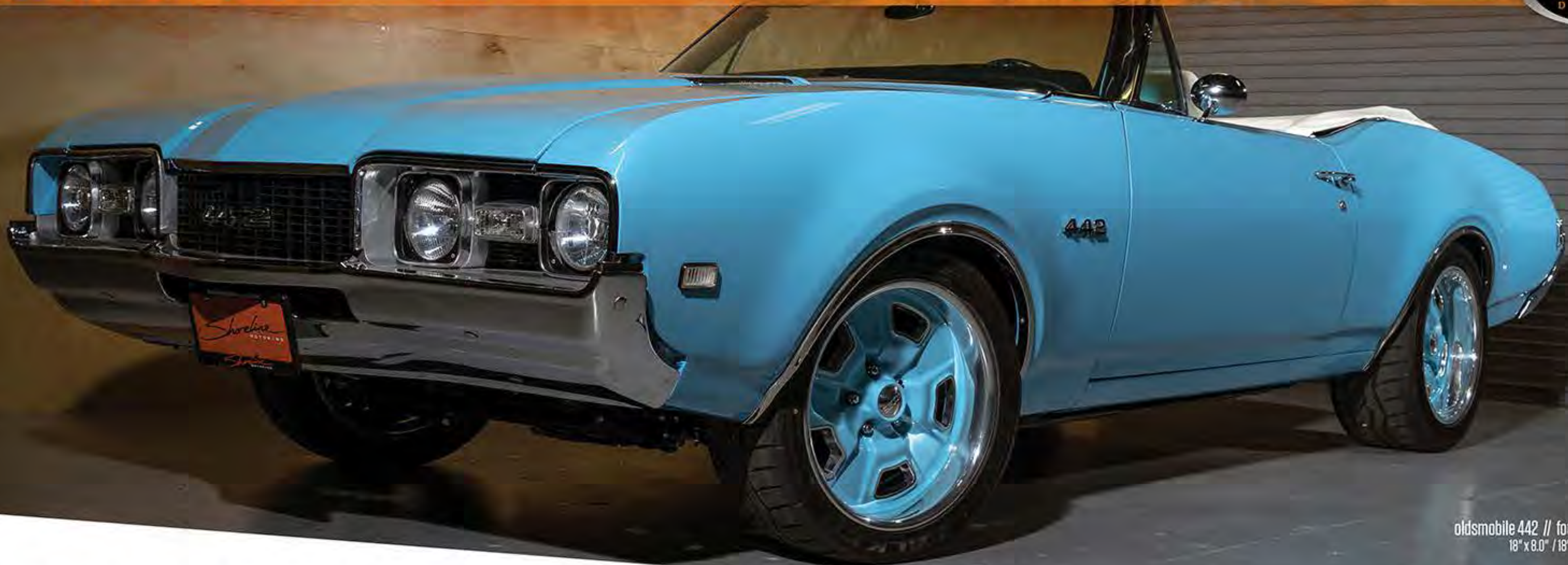
oldsmobile 442 // four42 18" x 8.0" / 18" x 10"

SOFT LIP: 17x7.0, 17x8.0, 17x10, 18x7.0, 18x8.0, 18x9.0, 18x10, 18x12, 18x15, 20x8.5, 20x9.0, 20x10, 20x10.5, 20x12, 20x15, 22x8.5, 22x9.0, 22x10, 22x10.5, 22x12, 24x9.0, 24x10, 24x12, 24x15, 26x9.0, 26x10, 26x12