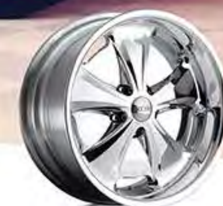
NOVA | F206 forged