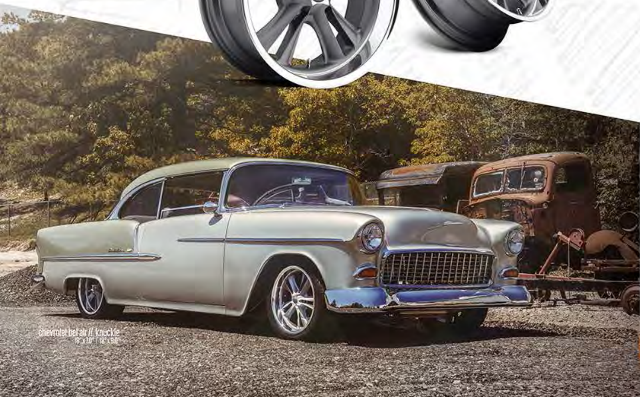
chevrolet bel air // knuckle 18" x 7.0" / 18" x 9.5"