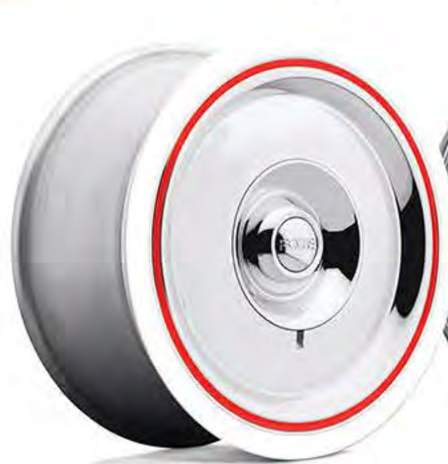
SAHARA | FR01 polished / custom painted sidewall