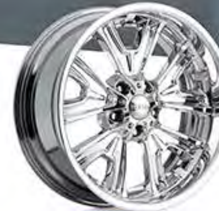
FISHTAIL | F205 forged