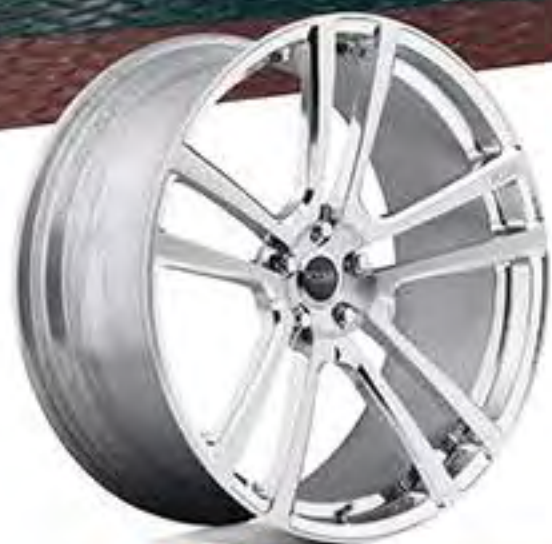
BOOST | F530

AVAILABLE SIZES 19"-26" SEE PAGES 147-152 FOR WIDTH AND PROFILE OPTIONS