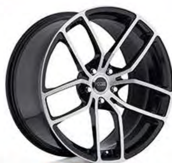
CLUTCH | F500