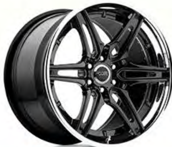
CRUZE SL | F511 CONCAVE