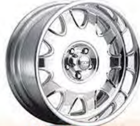
CHALLENGER | F223 forged