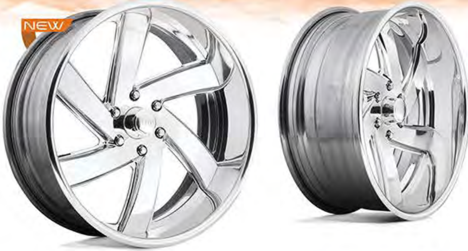
BEL-AIR 6 | F214 brushed face with hi-polish windows & accents