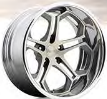
IMPALA | F229 CONCAVE forged