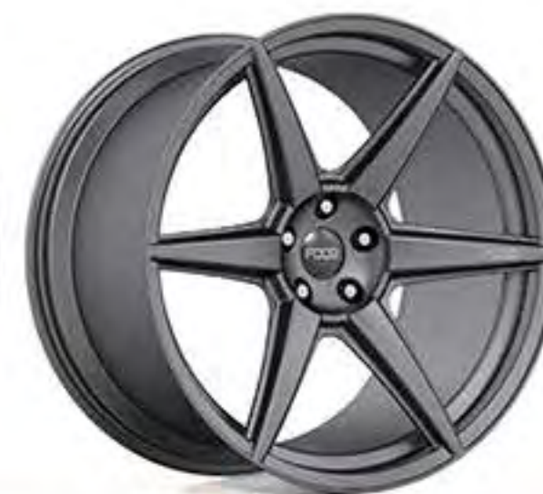
GT | F540 RENDERING SHOWN