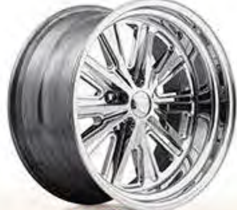
ASCOT | F226 forged