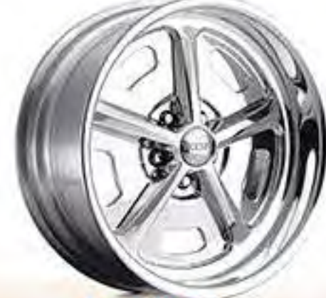
CORONET | F204 forged