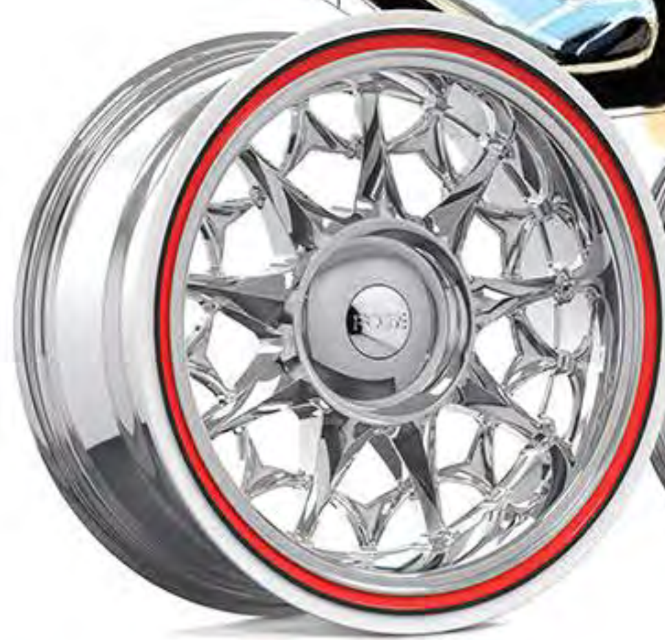
FLAMINGO | FR05 polished / custom painted sidewall rendering shown