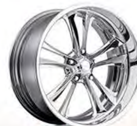
KNUCKLE | F227 forged cast 17, 18 & 20 patent D631816