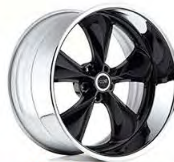
NITROUS SE | F300