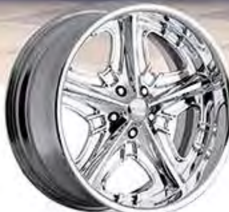
KNIGHT | F220 forged