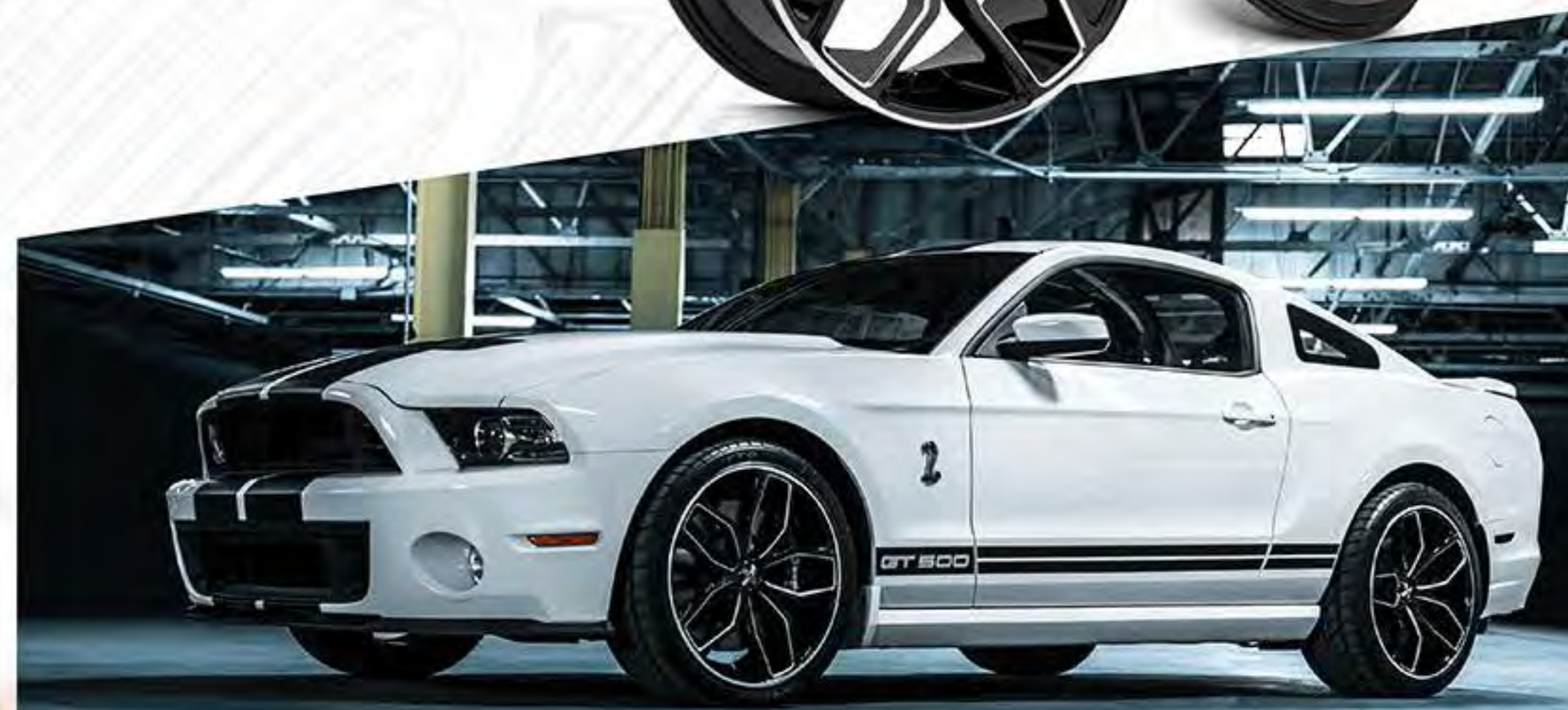
ford mustang // outcast 20 x 8.5 / 20 x 10