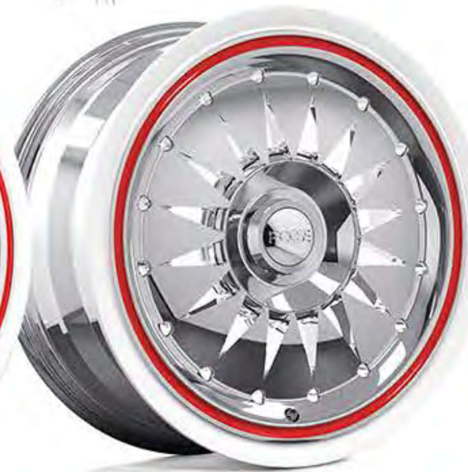
STARDUST | FR02 polished / custom painted sidewall rendering shown