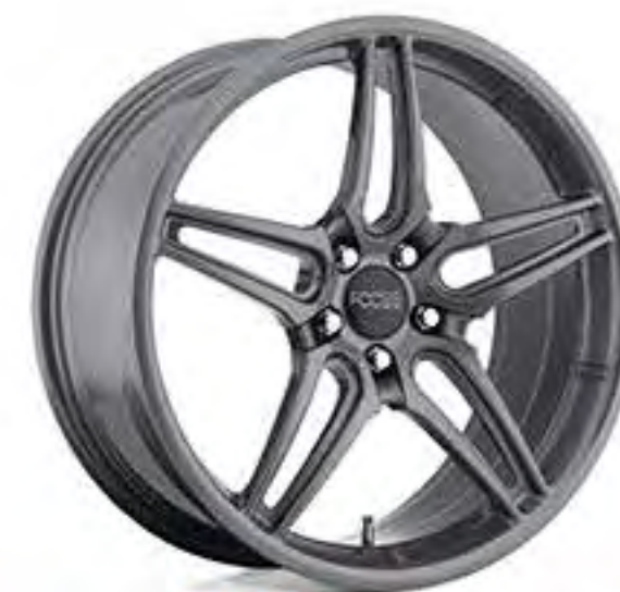
CRUZE | F510