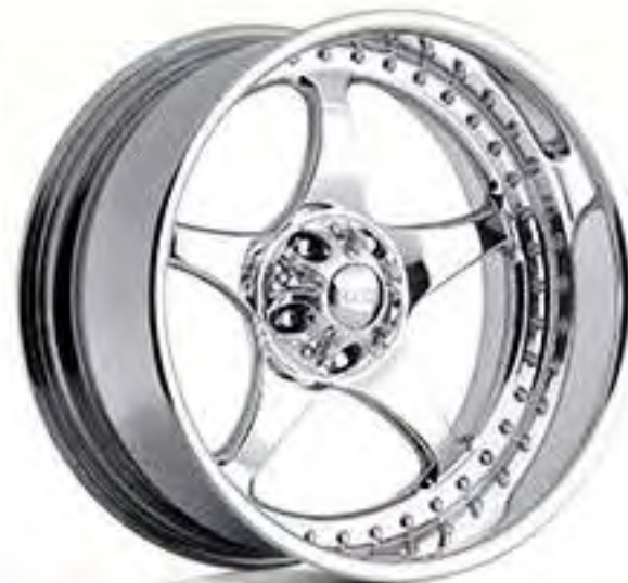
FIVE00 | F360