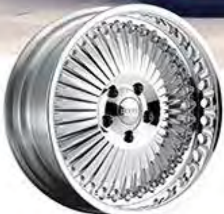
IMPERIAL | F208 forged