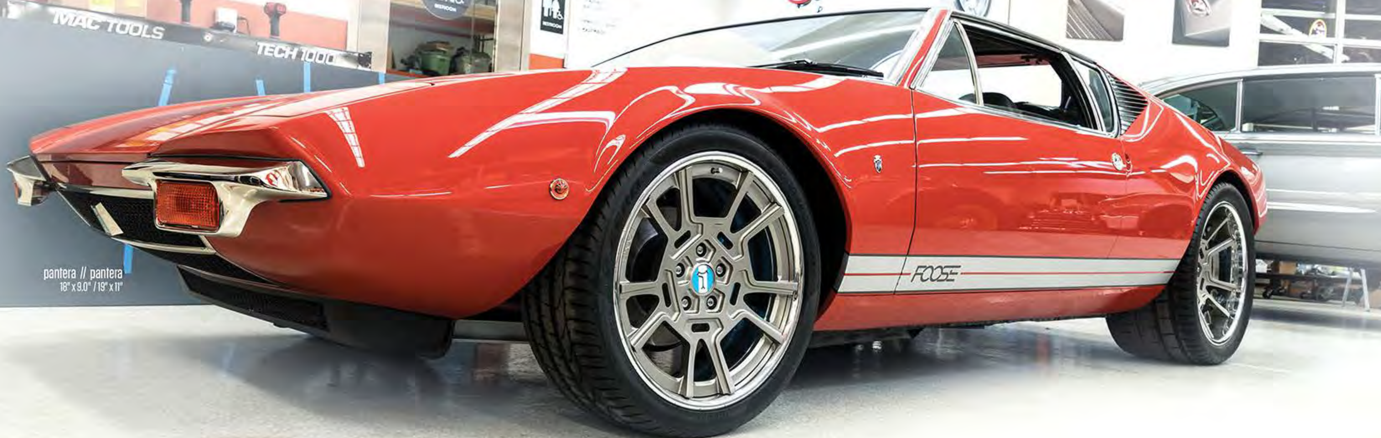
pantera // pantera 18" x 9.0" / 19" x 11"

AVAILABLE SIZES 18"-32" SEE PAGES 147-152 FOR WIDTH AND PROFILE OPTIONS