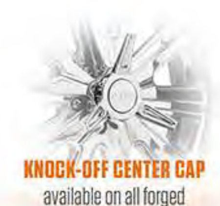
KNOCK-OFF CENTER CAP available on all forged Foose Design Wheels