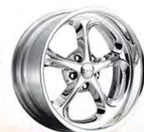
SHOCKWAVE | F209 forged