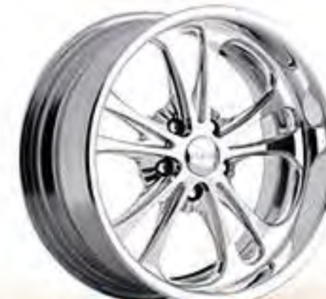
MONTEREY | F203 forged