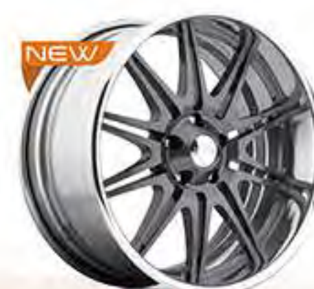
NEWS | F482 forged