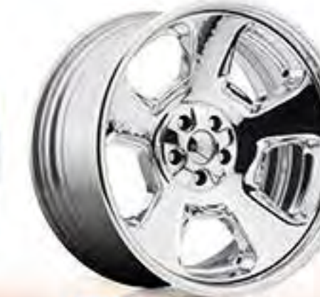
FURY | F261 CONCAVE forged