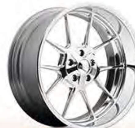
LIGHTWEIGHT | F231 forged