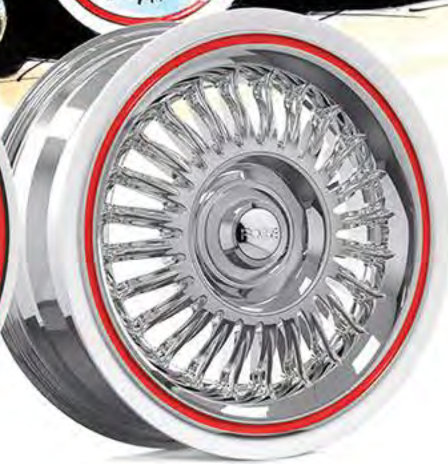
RIVERIA | FR04 polished / custom painted sidewall rendering shown