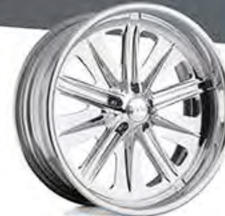
FIGHTER | F212 forged