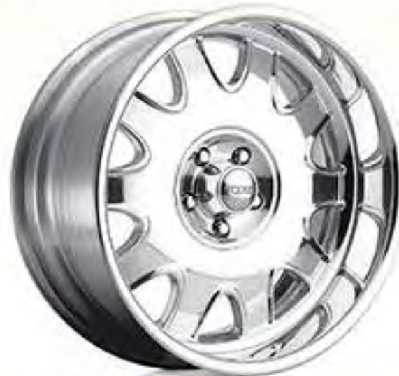
CHALLENGER | F330

AVAILABLE SIZES 18"-32" SEE PAGES 147-152 FOR WIDTH AND PROFILE OPTIONS