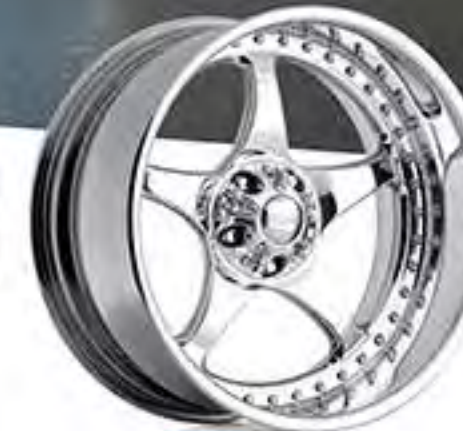
FIVE00 | F221 forged