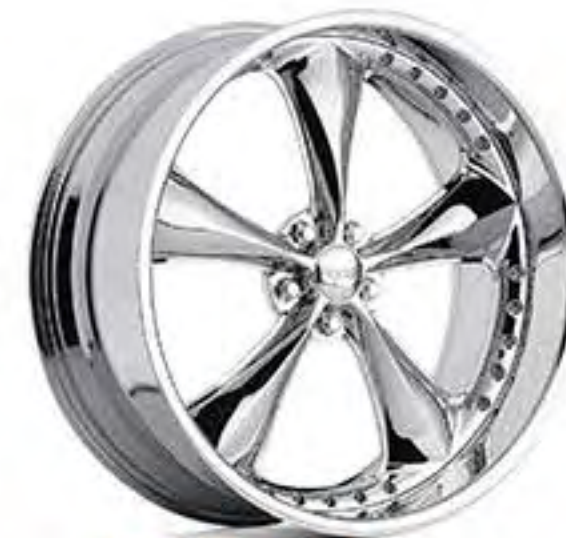
NITROUS SEC | F350