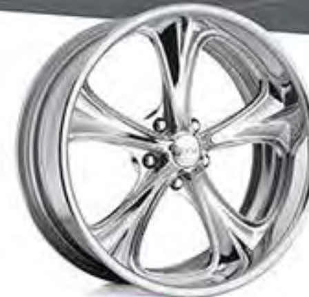
COUPE | F228 forged / cast - 17, 18 & 20 patent: D658561