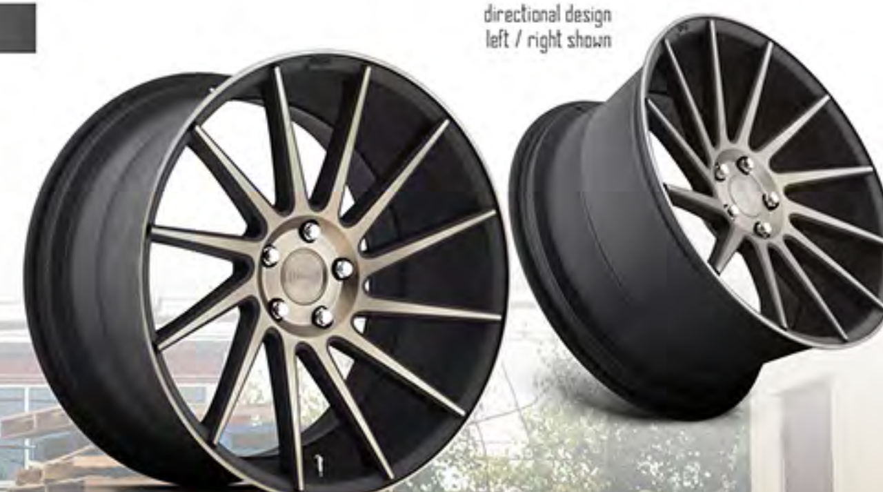
directional design left / right shown