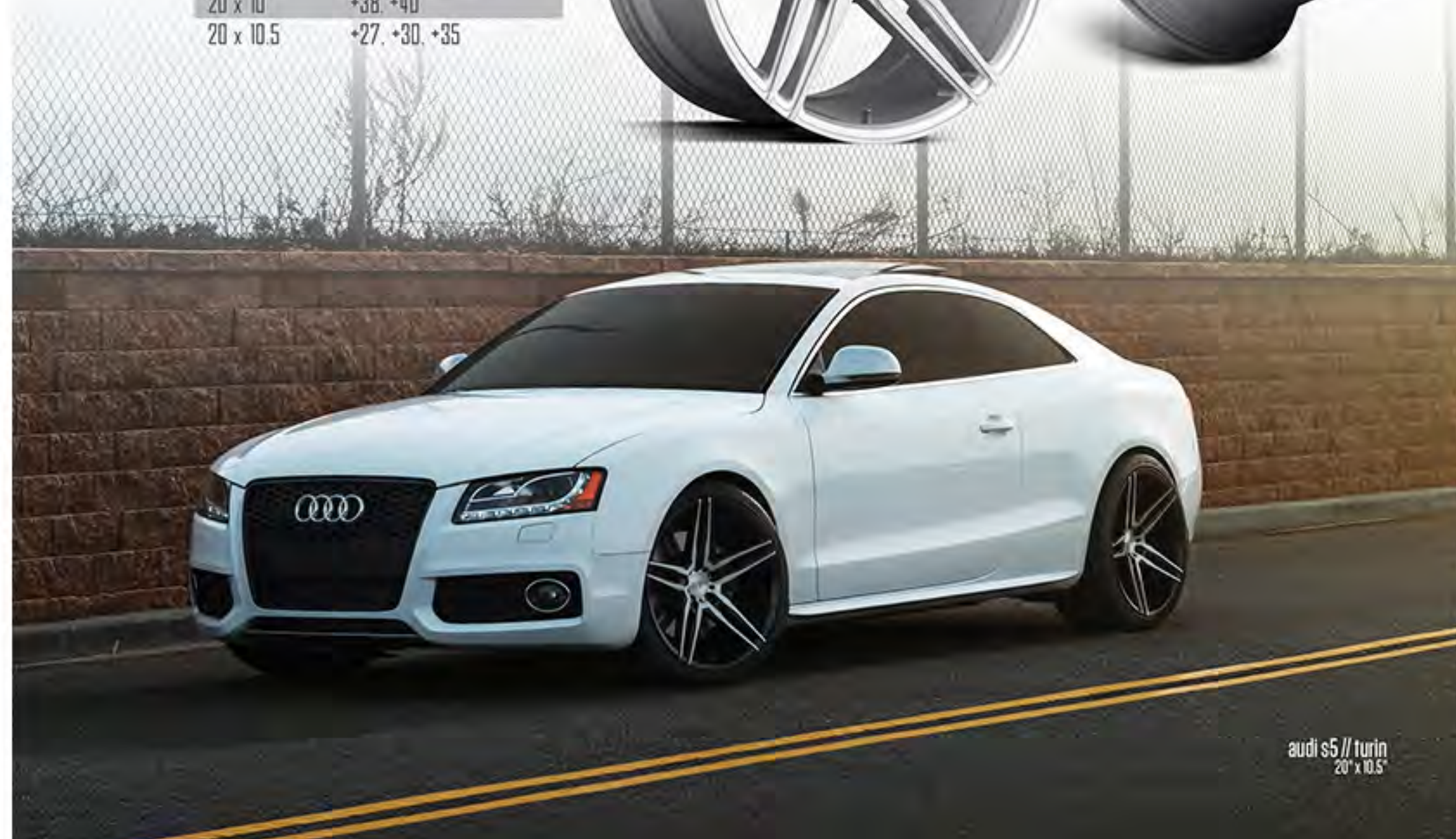
audi s5 // turin 20" x 10.5"