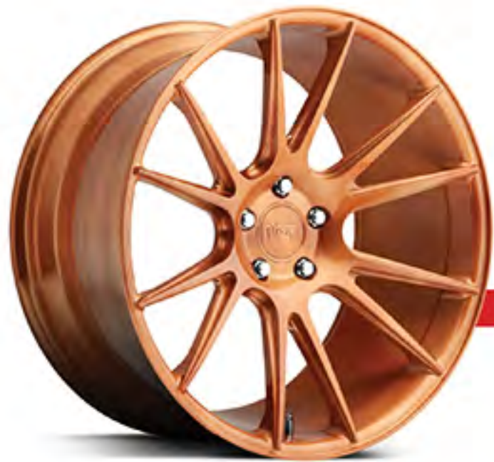
VICENZA.72 ◀◀monoblock reverse drop center forging