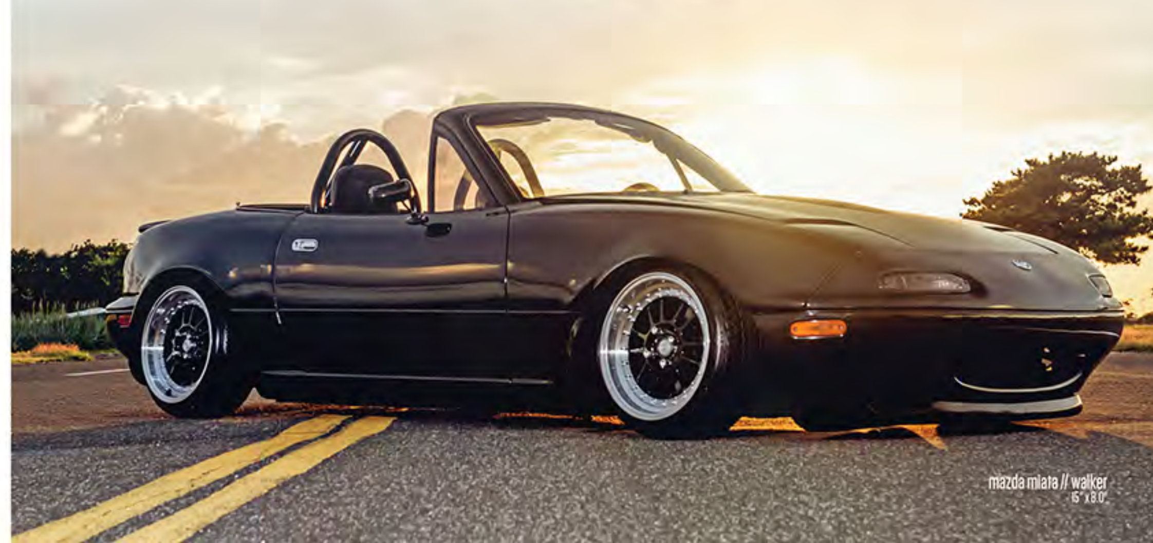
mazda miata // walker 15 x 8.0