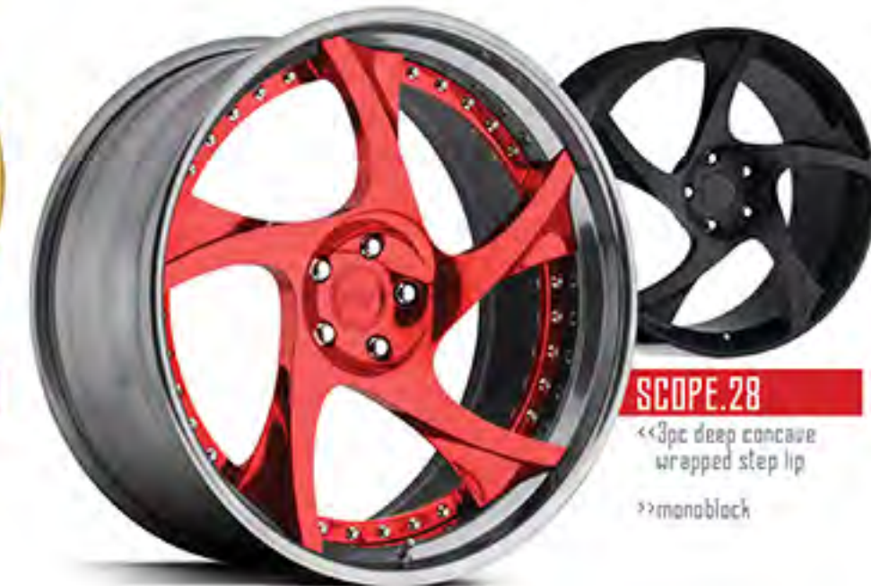
SCOPE.28 «3pc deep concave wrapped step lip »monoblock