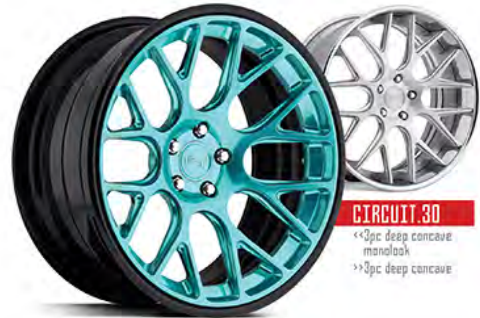
CIRCUIT.30 «3pc deep concave monoblock »3pc deep concave