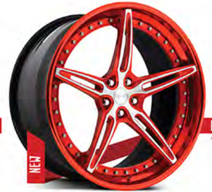
CAMBIO.901 «3pc deep concave step lip elevated spokes