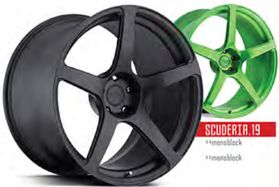
SCUDERIA.19 «monoblock »monoblock