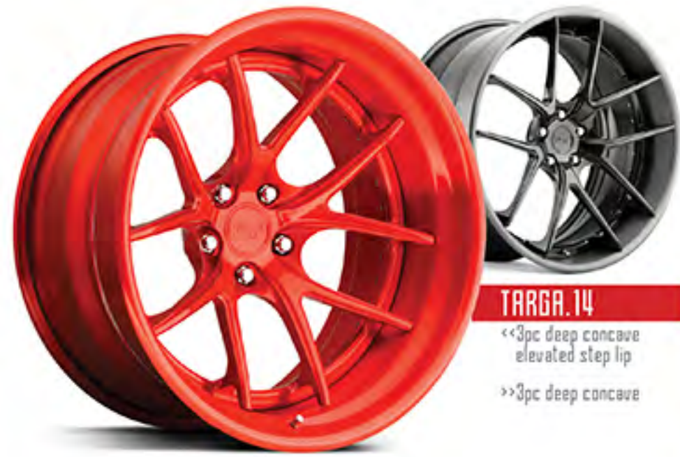
TARGA.14 ◀◀3pc deep concave elevated step lip ▶▶3pc deep concave