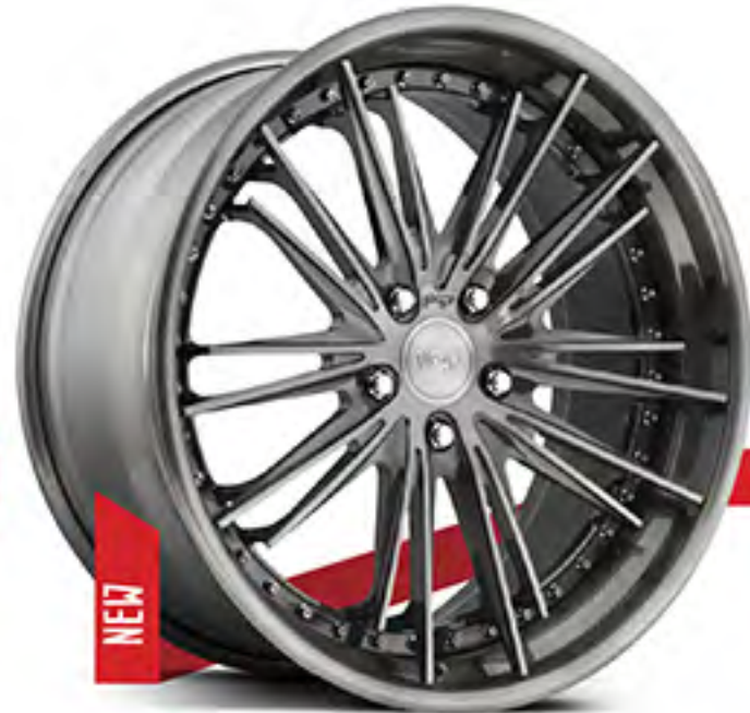
VENTUS.902 ◀◀3pc deep concave elevated step lip