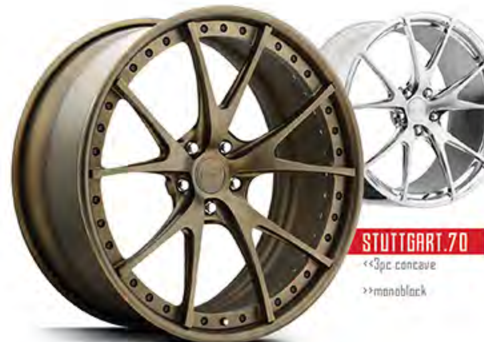
STUTTART.70 «3pc concave »monoblock