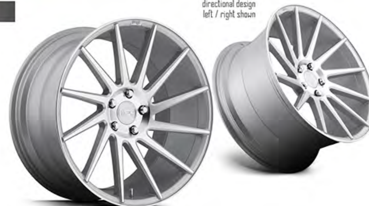
directional design left / right shown