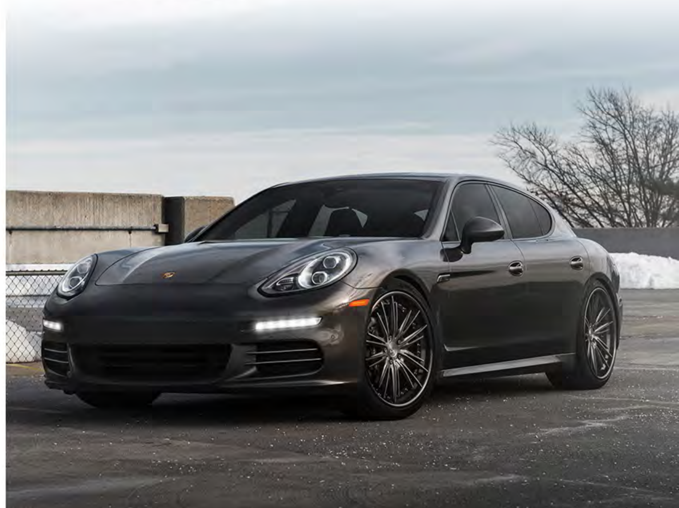
porsche panamera // ventus 22" x 9.0" / 22" x 11.5"