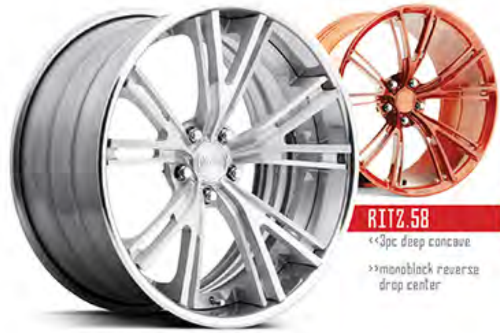
RITZ.58 «3pc deep concave »monoblock reverse drop center