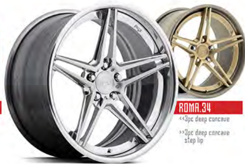
ROMA.34 «3pc deep concave »3pc deep concave step lip