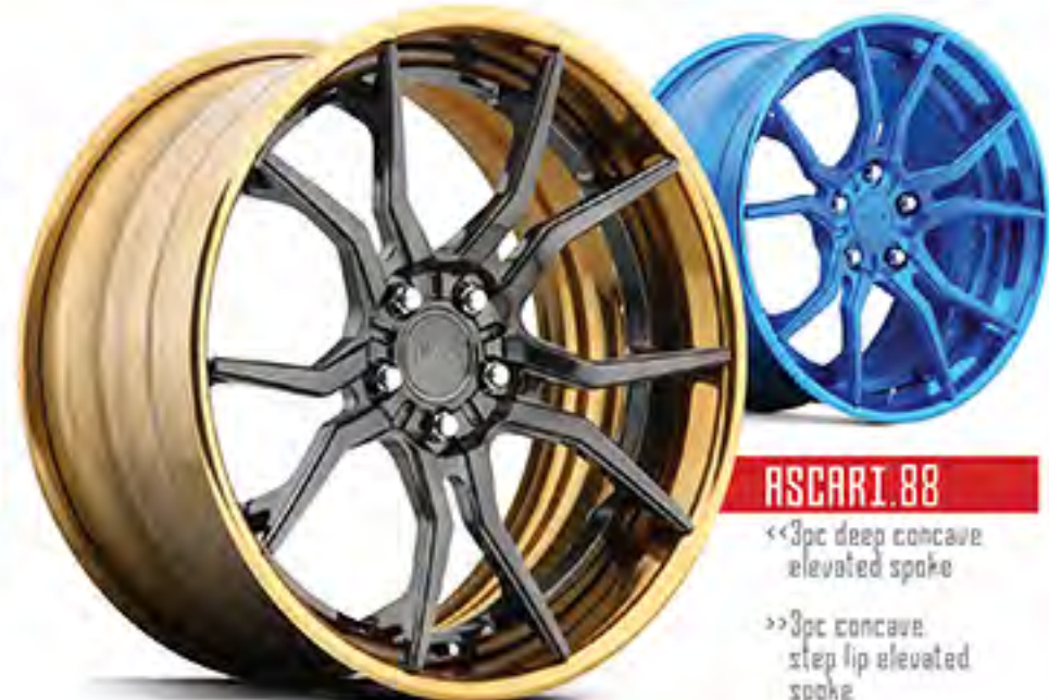
ASCARI.88 «3pc deep concave elevated spoke »3pc concave step lip elevated spoke