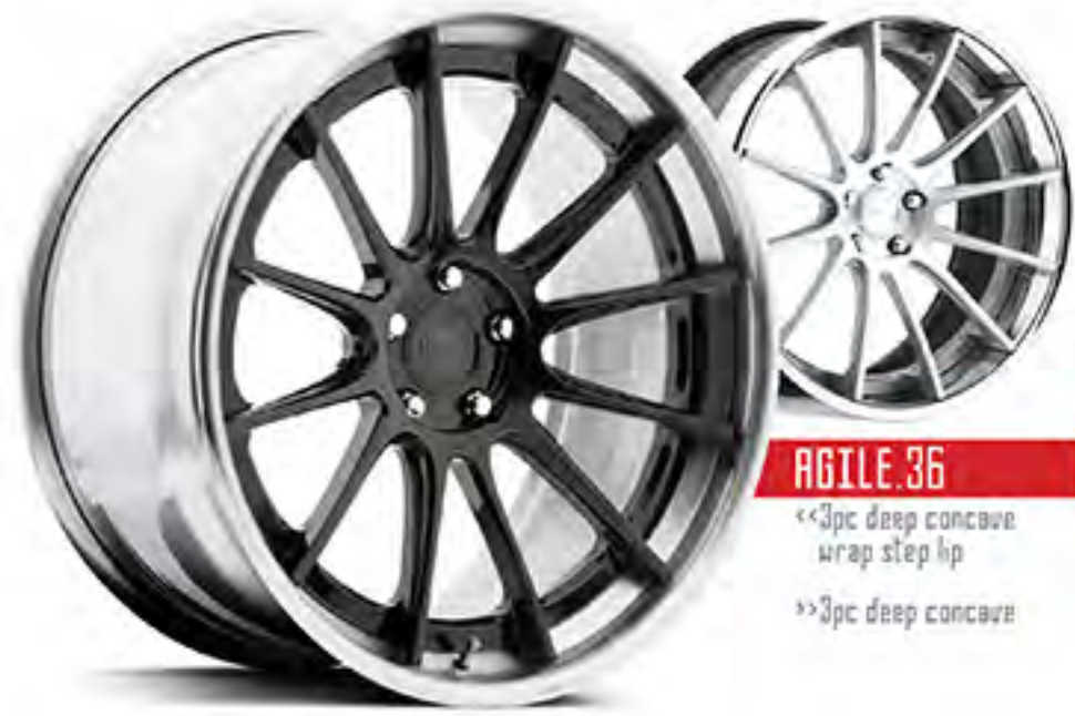
AGILE.36 «3pc deep concave wrap step lip »3pc deep concave