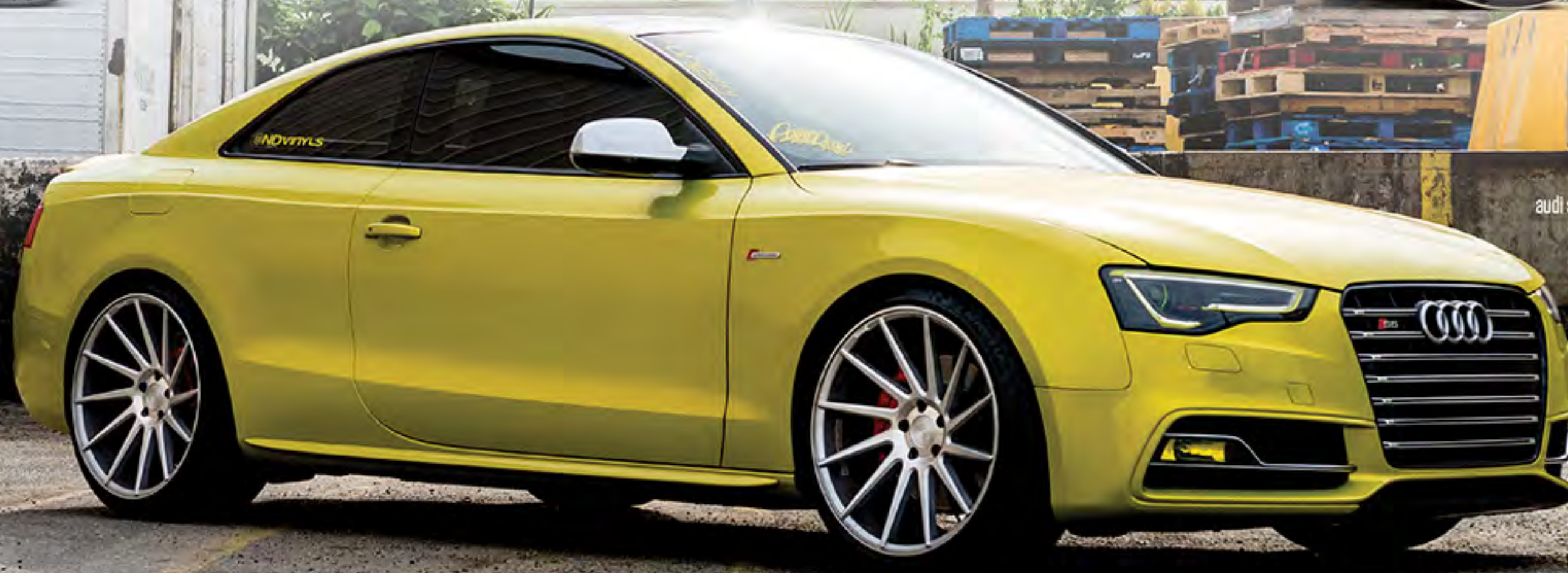
audi s5 // surge 20 x 10.5