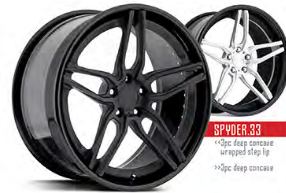
SPYDER.33 «3pc deep concave wrapped step lip »3pc deep concave