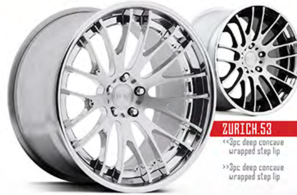
ZURICH.53 ◀◀3pc deep concave wrapped step lip ▶▶3pc deep concave wrapped step lip