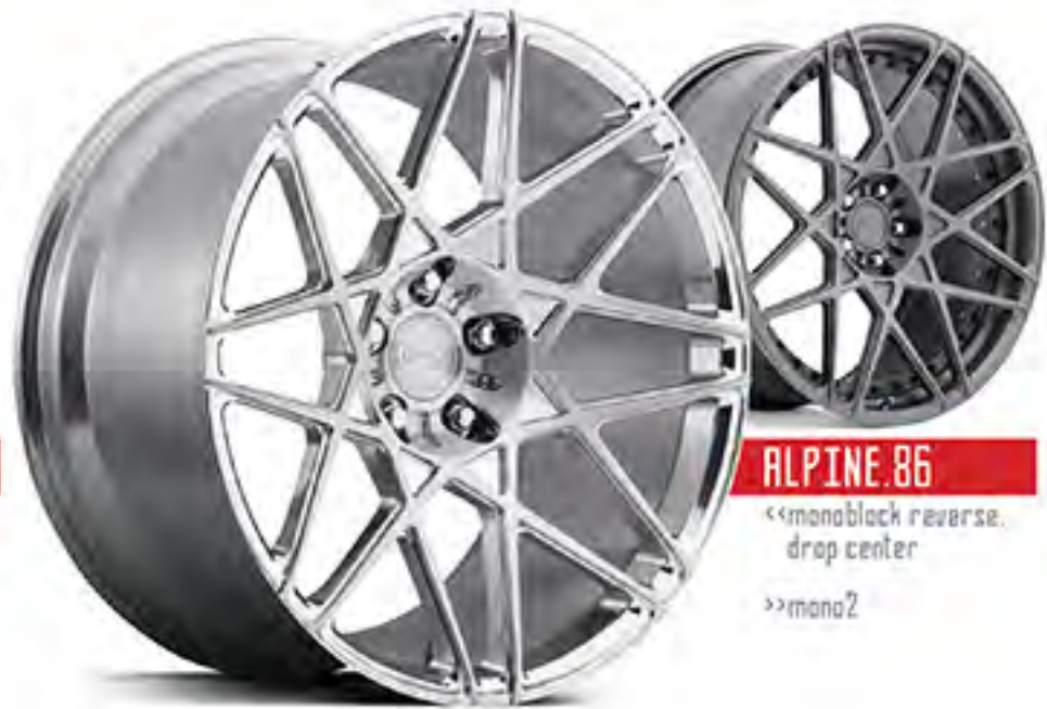
ALPINE.86 «monoblock reverse drop center »mono2