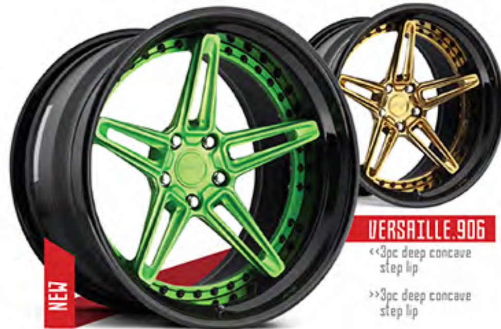
VERSAILLE.906 ◀◀3pc deep concave step lip ▶▶3pc deep concave step lip