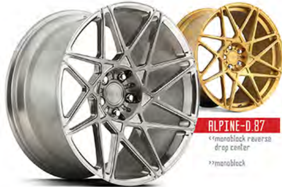
ALPINE-D.87 «monoblock reverse drop center »monoblock