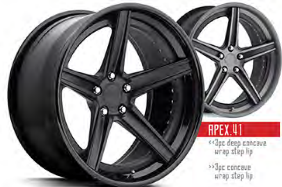
APEX.41 «3pc deep concave wrap step lip »3pc concave wrap step lip