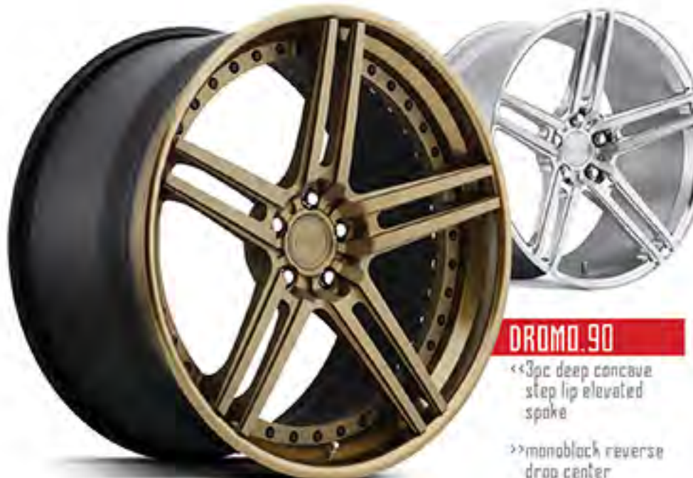
ORLANDO.90 «3pc deep concave step lip elevated spoke »monoblock reverse drop center