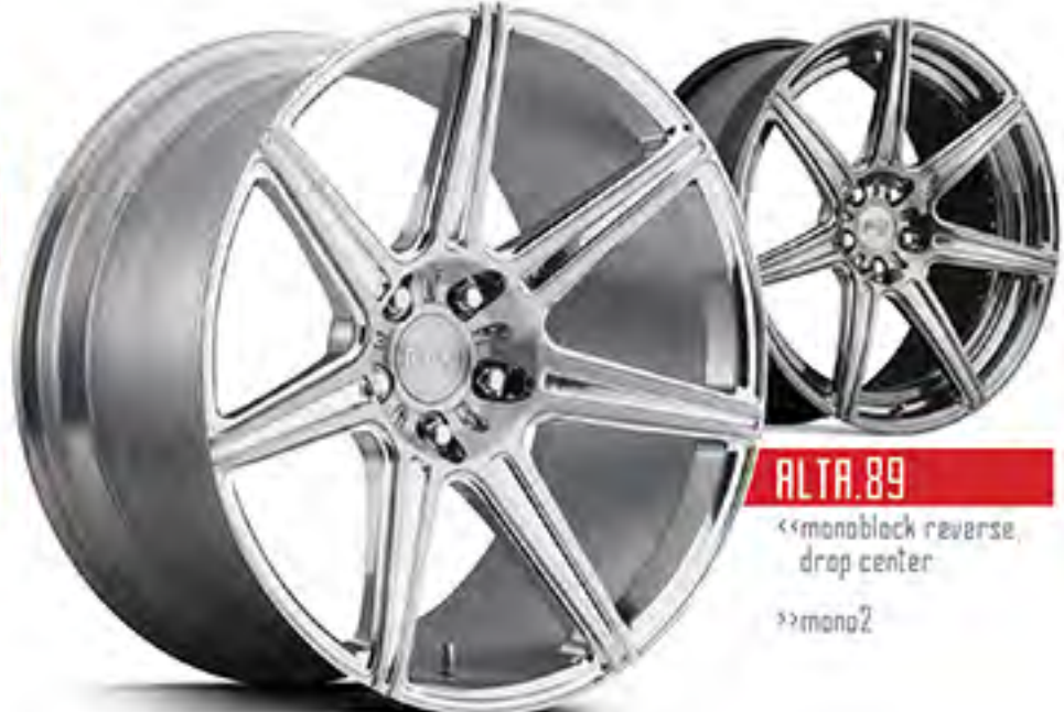
ALTA.89 «monoblock reverse drop center »mono2