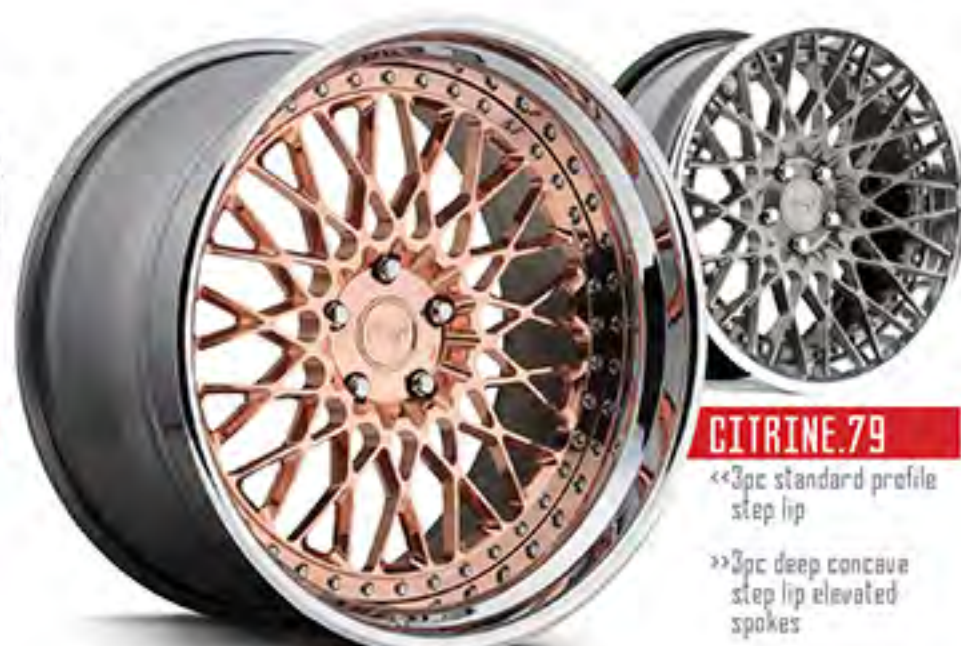
CITRINE.79 «3pc standard profile step lip »3pc deep concave step lip elevated spokes