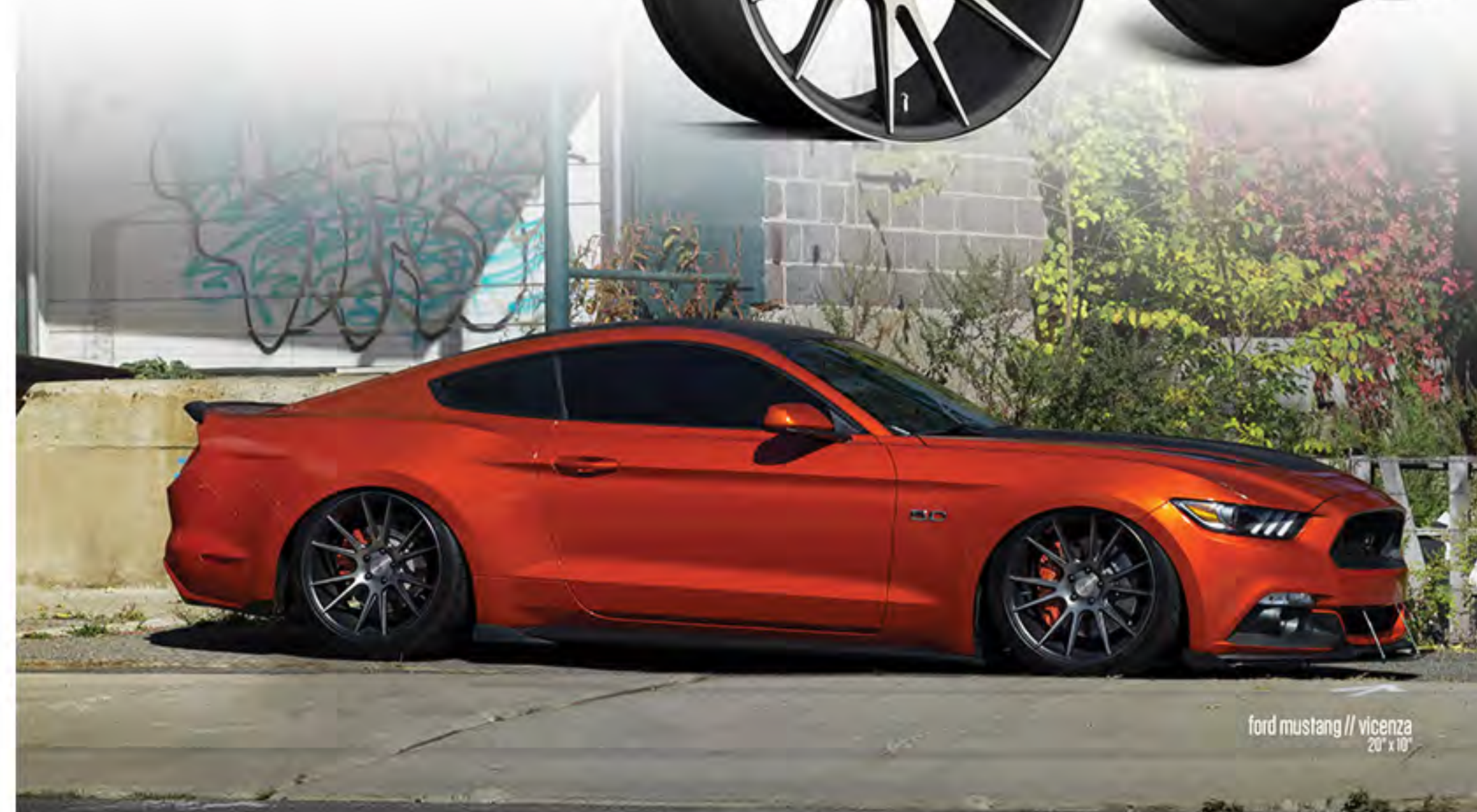
ford mustang // vicenza 20" x 10"