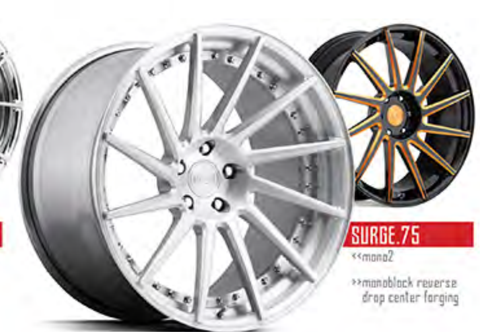
SURGE.75 «monoZ »monoblock reverse drop center forging