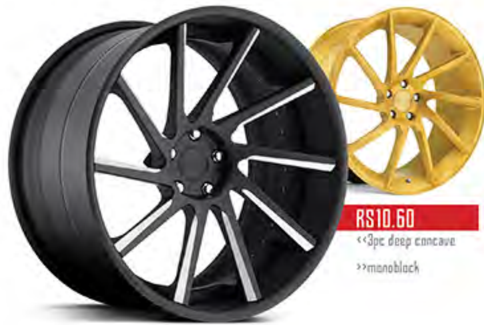
RS10.60 «3pc deep concave »monoblock