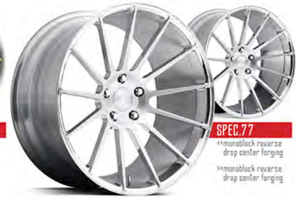
SPEC.77 «monoblock reverse drop center forging »monoblock reverse drop center forging