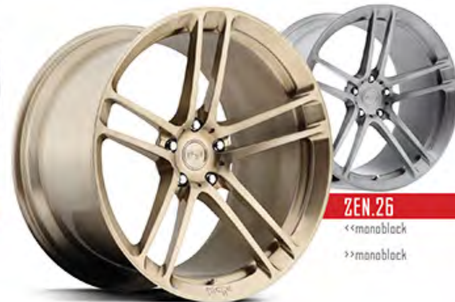
ZEN.26 ◀◀monoblock ▶▶monoblock