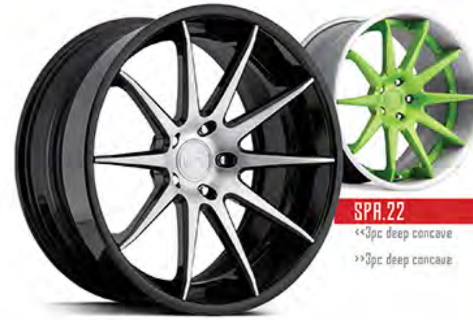
SPR.22 «3pc deep concave »3pc deep concave