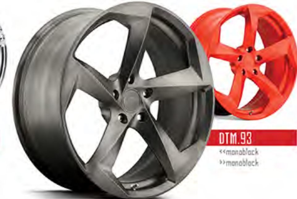
DTM.93 «monoblock »monoblock