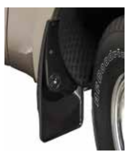
Installs Without Wheel/Tire Removal