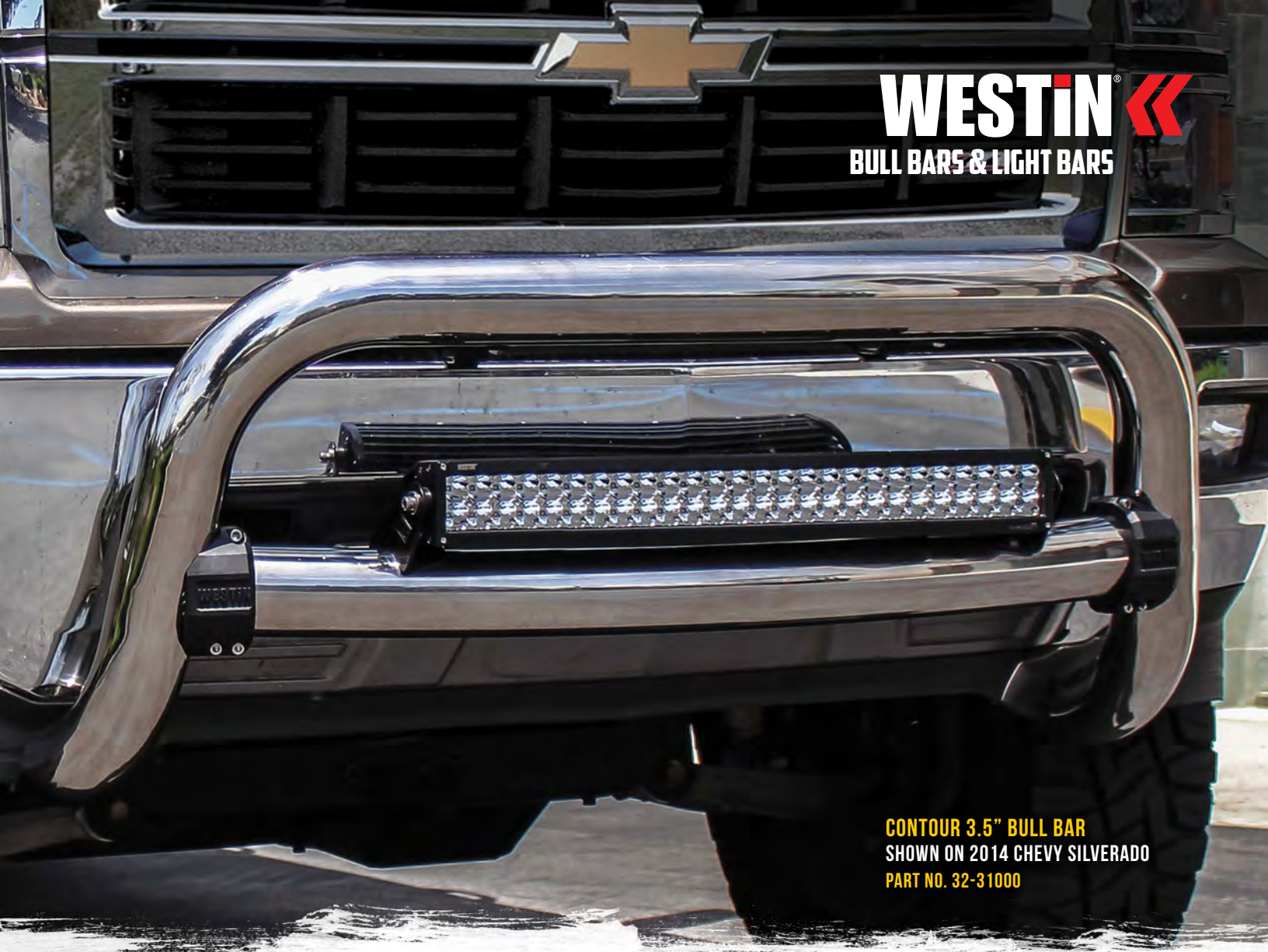
CONTOUR 3.5" BULL BAR SHOWN ON 2014 CHEVY SILVERADO PART NO. 32-31000