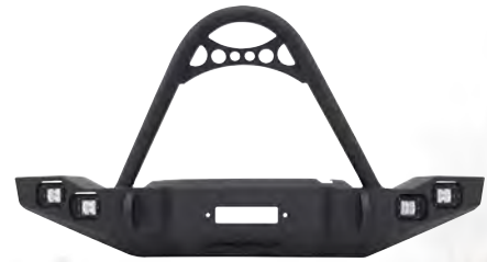
MARKSMAN STINGER FRONT BUMPER*