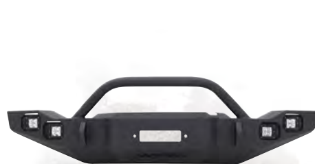
MARKSMAN BULL BAR FRONT BUMPER*