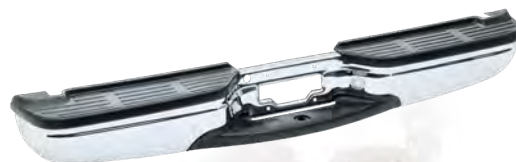
FORD SUPERDUTY PART NO. 31002