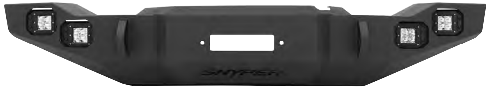
MARKSMAN FRONT BUMPER*

*Shown with (4) FMAQ LED Flush Mount Lights - Sold Separately