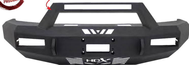
HDX FRONT BUMPER OPTIONAL LIGHT BAR SOLD SEPARATELY