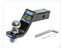
BALL MOUNT KITS