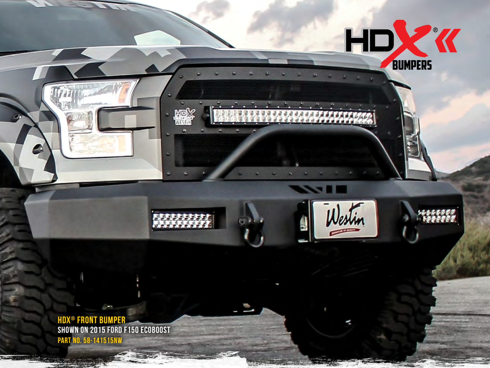
HDX ® FRONT BUMPER SHOWN ON 2015 FORD F150 ECOBOOST PART NO. 58-141515NW