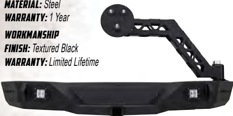
RECOIL REAR BUMPER WITH TIRE CARRIER ALSO AVAILABLE

FINISH: Textured Black MATERIAL: Steel WARRANTY: 1 Year WORKMANSHIP FINISH: Textured Black WARRANTY: Limited Lifetime