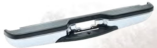
DODGE RAM PART NO. 31004