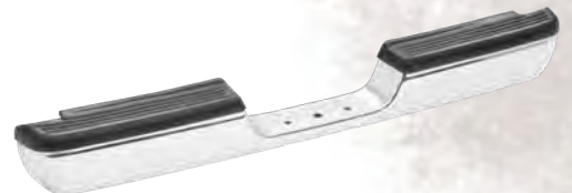
DODGE RAM PART NO. 31005