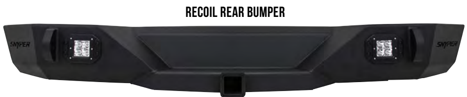
RECOIL REAR BUMPER