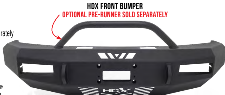
HDX FRONT BUMPER OPTIONAL PRE-RUNNER SOLD SEPARATELY