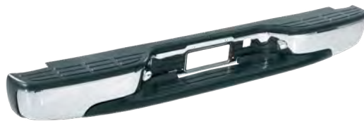
CHEVY/GMC SILVERADO/SIERRA "CLASSIC" PART NO. 31006

FINISH: Chrome, Black and Gray MATERIAL: Molded Polymer Step Pads WARRANTY: 3 Year