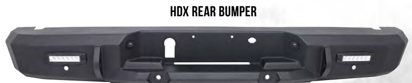
HDX REAR BUMPER

WORKMANSHIP FINISH: Textured Black or Raw WARRANTY: Limited Lifetime