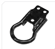
MAX® TOW HOOK PART NO. 46-3005