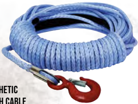
SYNTHETIC WINCH CABLE