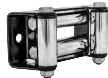
4-WAY ROLLER FAIRLEAD (ATV PRO SERIES)