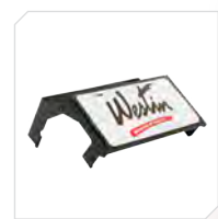
LICENSE PLATE RE-LOCATOR PART NO. 46-20055

FINISH: Black Powder Coat MATERIAL: Steel WARRANTY: 3 Year