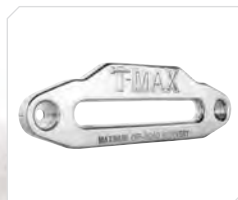
HAWSE FAIRLEAD PART NO. 47-3410