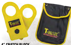
4" SNATCH BLOCK