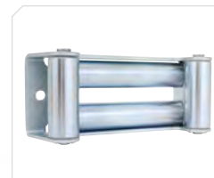
4-WAY ROLLER FAIRLEAD PART NO. 47-3400