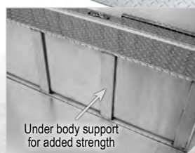
Under body support for added strength